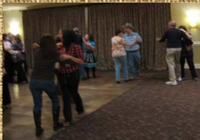
Above: Allemande left and do-se-do, grab your partner, here we go!