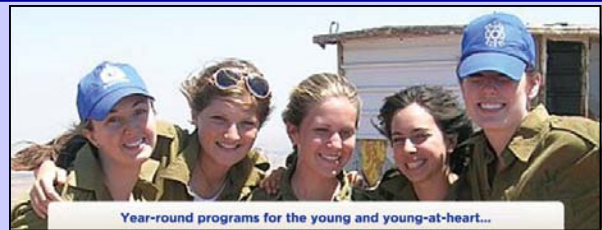
Year-round programs for the young and young-at-heart...

Volunteers for Israel (VFI) is pleased to announce a Southeastern (8 states) Regional trip to Israel, from February 06 through February 24, and would like to invite members of your congregation and/or organization to join them.