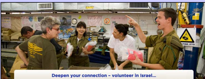
Deepen your connection - volunteer in Israel...

Volunteers can travel locally, on their own, during the weekends - from Thursday noon until Sunday morning. This will be an adventure of a lifetime, in only three short weeks.